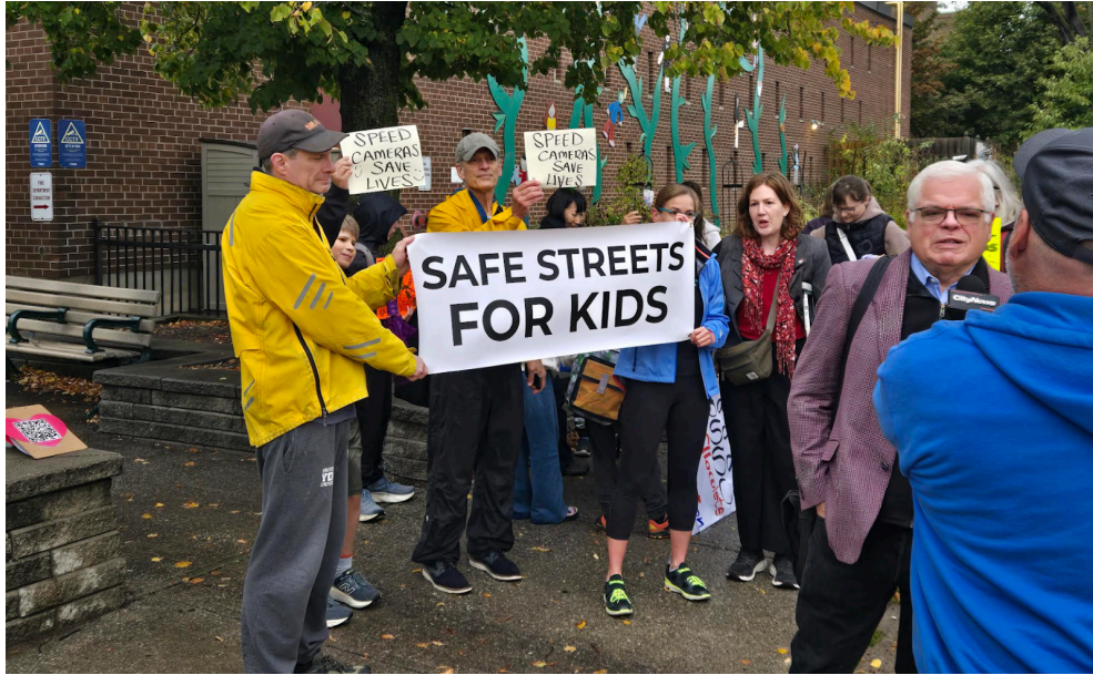
Junction/West End Toronto