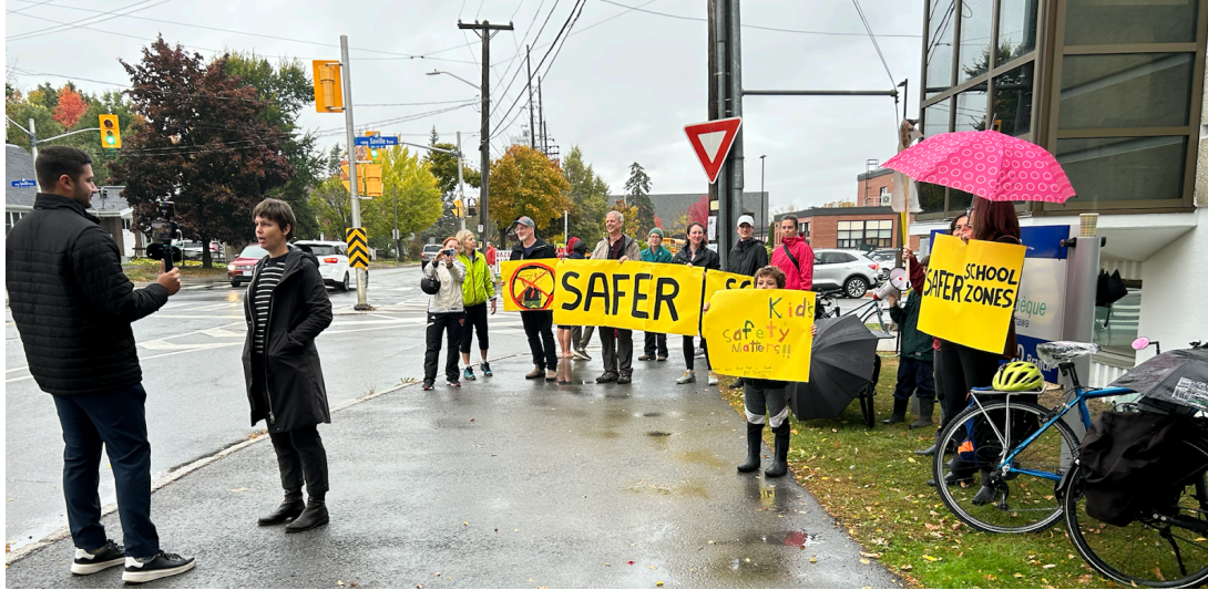
Ottawa, Queen Elizabeth School